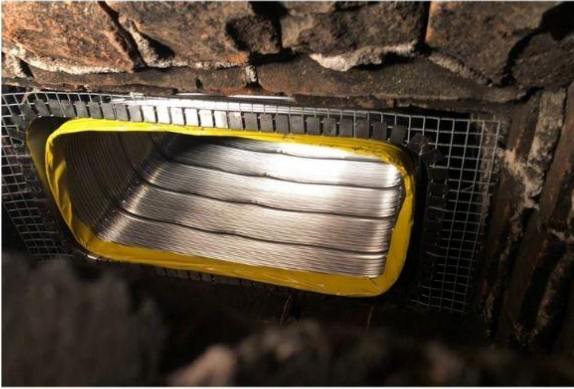
Mesh Bottom Plate Before