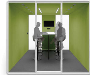
Pneumatic adjustable stool x 6 + Back pillar + WM 180 bar table