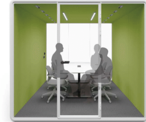
Meeting chair x 6 + 180 meeting table