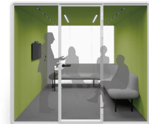
230 L-shape couch + C-shape coffee table