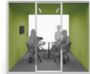
Swivel armchair x 4 + Rounded table