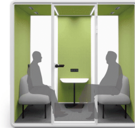
82 couch x 2+ Back pilaster + Trapezoidal coffee table