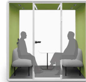
82 couch x 2 + Trapezoidal coffee table