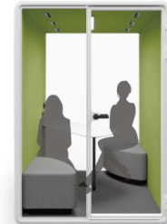
Corner bench x 2 + WM F2F table