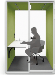
Swivel armchair + WM working table