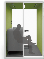
Privacy couch + C-shape coffee table