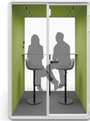
Pneumatic adjustable stool x 2 + WM bar table