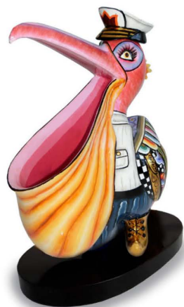
PELICAN BOWL PETROS 17 x 29 x h 40 cm / # 4577