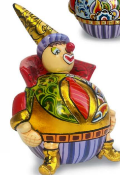
CLOWN ALFREDO L 16 x 16,5 x h 22 cm / # 4585