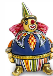
CLOWN ALFREDO M 13 x 15 x h 17 cm / # 4584