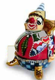
CLOWN ALFREDO S 8,5 x 9 x h 12,5 cm / # 4578