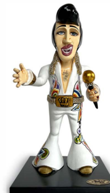
ELVIS P. 13,5 x 13,5 x h 27 cm / # 4575