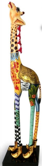
LITTLE ROXANNA 16,5 x 23 x h 101 cm / # 4574