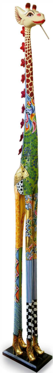
ROXETTE XXXL 24,5 x 39 x h 300 cm / # 102206 limited 100