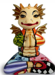
YOGA DRAGON DRAGAN 9,5 x 7 x h 12,5 cm / # 4579