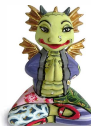
YOGA DRAGON DRAGANA 9,5 x 7 x h 12,5 cm / # 4580