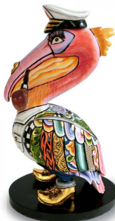
PELICAN PETROS S 12,5 x 19,5 x h 33 cm / # 4576