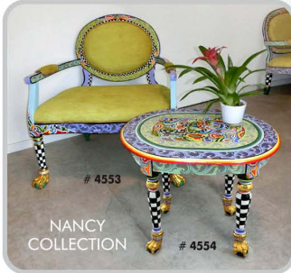
# 4553 # 4554 NANCY COLLECTION