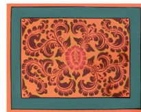
DRAG CHEST ANCONA 43 x 35 x h 67 cm / # 4582

Every object is exclusively crafted by hand and therefore a unique piece of art with slight variations!