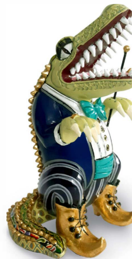
LITTLE LEONARD B. 19 x 22 x h 40 cm / # 4583