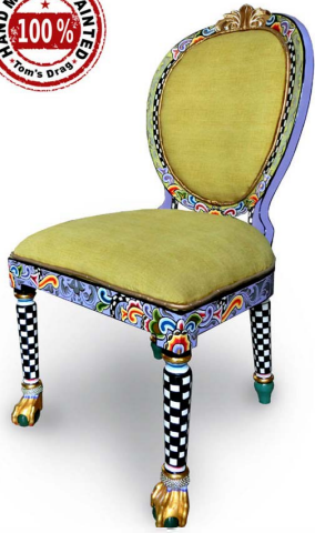
CHAIR NANCY COLLECTION 52 x 70 x h 101 cm / # 4551