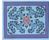
DRAG CHEST ANCONA 43 x 35 x h 67 cm / # 4581