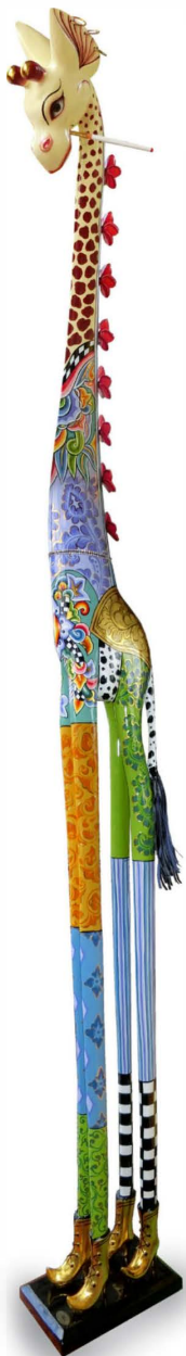
ROXETTE XXXL 24,5 x 39 x h 296 cm / # 102207 limited 100