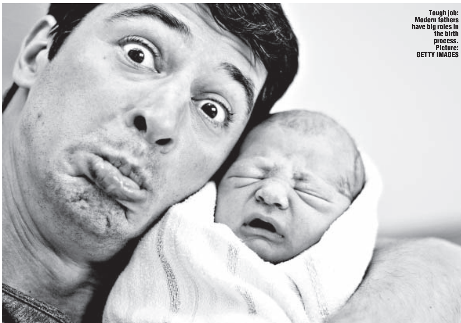
Tough job: Modern fathers have big roles in the birth process.