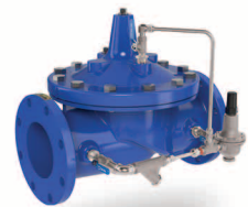
Cla-Val Automatic Control Valves