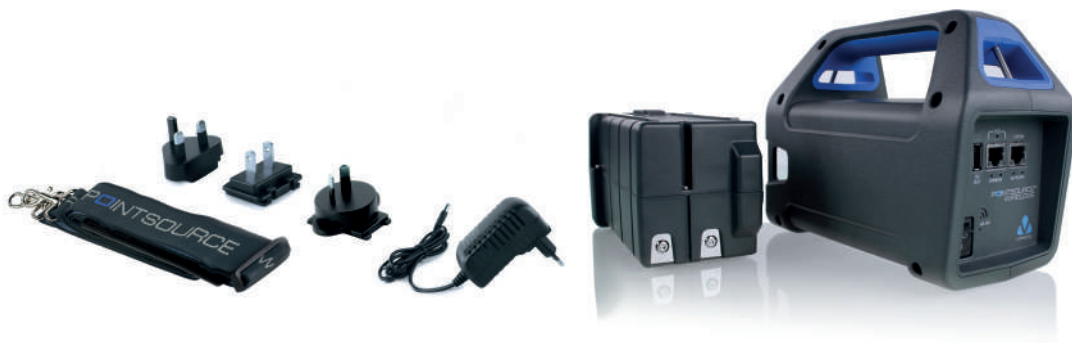
IP CAMERA INSTALLATION TOOL COMPARISON TABLE