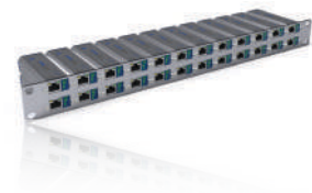
Up to 24 LONGSPAN units can be mounted in a 1U rack space. Ask for VLS-1U

Distances may be increased by connecting multiple links in series. Data rate at full range stated : 100Base-T = 200Mbps, 10Base-T = 20Mbps