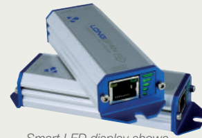
Smart LED display shows SAFEVIEW™ technology.

separate POE injector may be used as the Base power source. Maximum power and range is achieved with the optional 57V Veracity PSU, enabling the LONGSPAN Base unit to become the POE injector for the link.