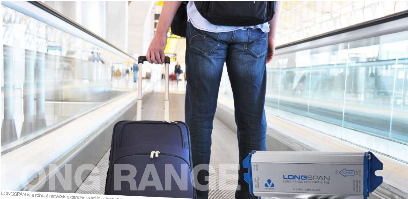
LONGSPAN is a robust network extender used in railway networks over extreme distances and is BS EN 50121-4 (rail + metro).