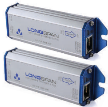
LONGSPAN BASE and CAMERA are sold separately.

LONGSPAN delivers unrestricted 100Base-T with 802.3af and 802.3at POE at distances far beyond the normal Ethernet limits for problem free IP camera installation