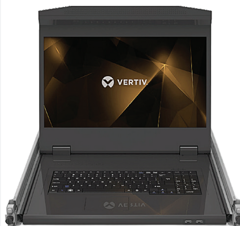
Vertiv 18.5" CLRA Local Rack Access Console

You understand how valuable data center real estate can be. A crowded server rack can make your job a lot harder. The CLRA Console is available with pre-integrated 8- and 16- port KVM that seamlessly fits into the same 1U the LCD tray is occupying, providing vastly improved utility while conserving space.