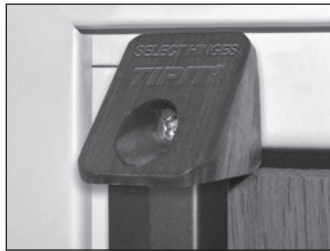
Black polymer TIPIT® C on Dark Bronze concealed hinge.

SELECT's patented, ligature-resistant TIPIT® keeps patients safer. Whether as a retrofit application for existing hinges or in new construction, the TIPIT will deter patients or inmates from harming themselves by hanging objects from the hinge.