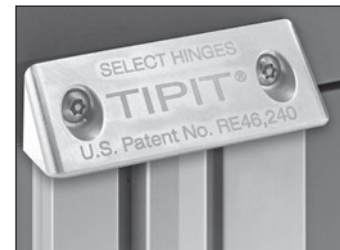
Metal TIPIT® L on Clear anodized SL57 full surface hinge.