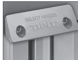
Gray polymer TIPIT® L on Clear anodized SL57 full surface hinge.