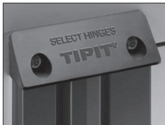
Black polymer TIPIT® L on Dark Bronze SL57 full surface hinge.

NOTE: Not for use with concealed safety hinges (SL71).