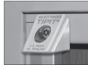
Metal TIPIT® C on Clear anodized concealed hinge.