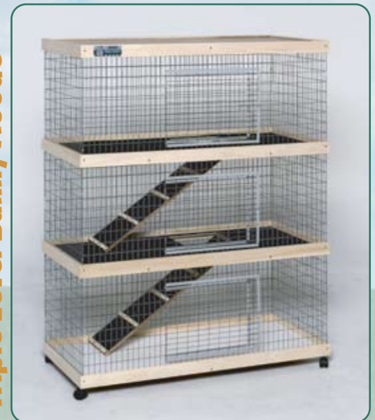
Triple Level Bunny Abode

Ample room for the single bun, perfect for a pair or trio. The best choice for rabbits who are not free roaming in the home.