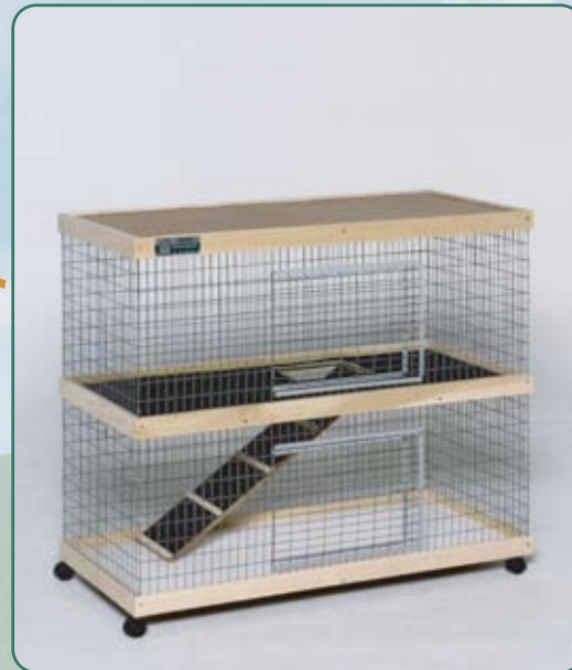
Double Level Bunny Abode

A perfect combination of economy and space. Comfortable for a larger rabbit, or a pair with ample time to roam about.