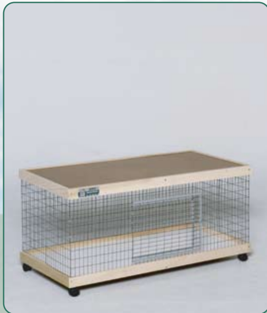
Single Level Bunny Abode

The entry level option, suitable for one small rabbit or the free roaming rabbit that simply needs their own special place.