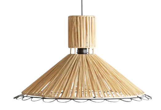
Natural Selection Ibiza Pendant by Honoré Deco, $165, honoredeco.shop