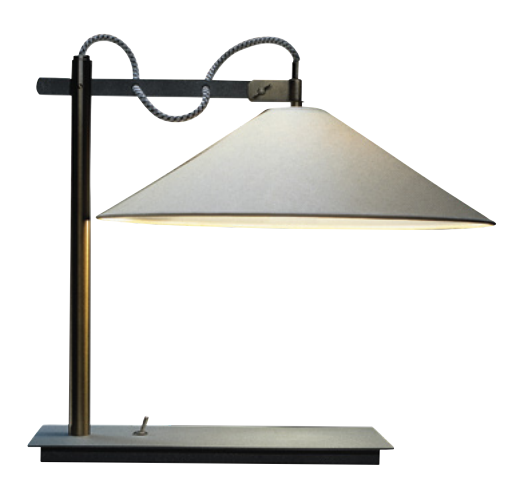
Task Master Kraft Lamp by Ecart International, $1,185, ecart.paris