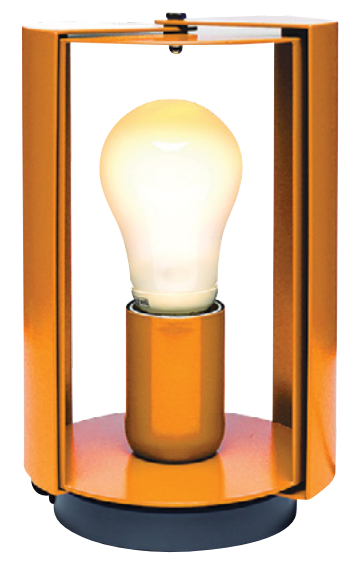
Lightbulb Effect Pivotante à Poser table lamp by Charlotte Perriand for Nemo Lighting, $383, hivemodern.com