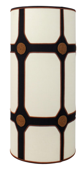
Graphic Arts Abat-Jour Colonne Lamp by Coline de Masure, $632, debeaulieu-paris.com