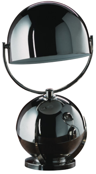
Mod Moment 1925 Lamp by Felix Aublet for Ecart International, $1,982, ecart.paris