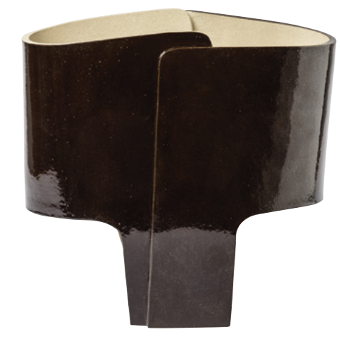
Film Noir Nocta Lamp VII by Denis Castaing for Kolkhoze, $1,702, kolkhoze.fr