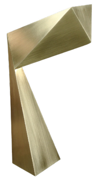
Cutting Edge Origami Table Lamp by François Champsaur for Pouenat, $10,500, lustare.com