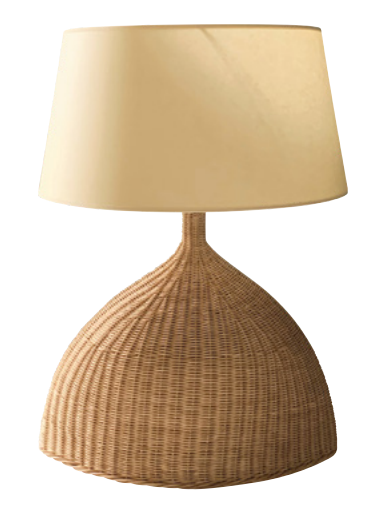
The Shape of Things LP Lamp by Atelier Vime Editions, $1,646, ateliervime.com