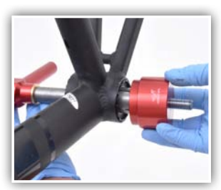
4. Select a sleeve size that has a larger ID than the bearing's OD. Slide receiver cup + reducer sleeve over the rod and up againt cup.