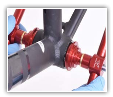
10. Spin on second press hande and fully tighten until non-drive side cup is flush with frame.