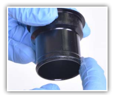
7. Apply a thin layer of grease to the inner o-ring on the male cup.