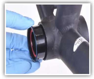
Insert drive side cup (female) into frame by hand. Check that any internal wires or hoses are out of the way of the cup.