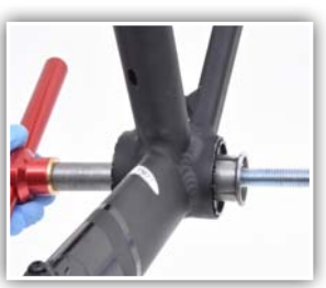
3. Insert handle, rod, pusher and adapter into the backside of the bearing you are removing.