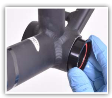
Insert non-drive side (male) cup by hand. Check that any internal wires or hoses are out of the way of the cup.