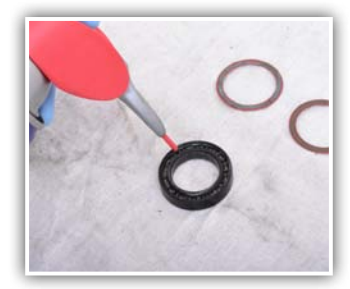
2. Flush out old grease with a de-greaser. Dry bearing to remove any traces of degreaser.