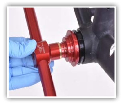
4. Using Wheels Mfg Universal Bottom Bracket Press [PRESS-7 or PRESS-7-PRO], insert one BB adapter into drive side bearing. Match the correct size step on the drift with bearing inner diameter. Slide press handle + rod thru BB adapter and cup.