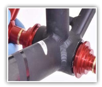
Using Wheels Mfg Universal Bottom Bracket Press [PRESS-7] or PRESS-7-PRO], insert one BB adapter into each bearing. Match the correct size step on the drift with bearing inner diameter. Slide press handle + rod thru BB adapters and cups.