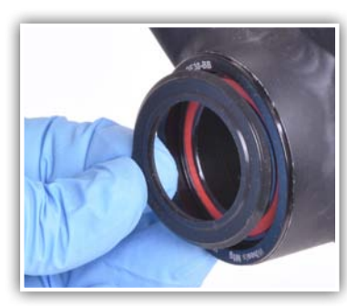
Outer silicone dust seals are placed directly against bearings. For added sealing, apply grease between seal and bearing.