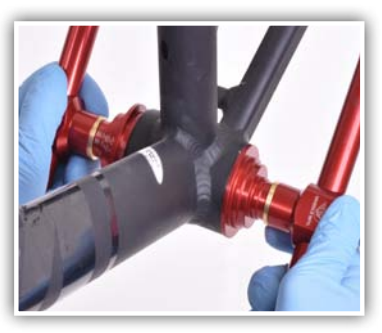
Spin on second press handle and fully tighten until drive side cup is flush with frame.