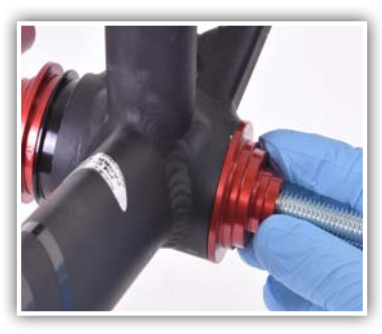
Slide second BB adapter onto threaded rod and into the opposite side of the bottom bracket shell. Match the correct step size with the BB shell inside diameter. Adapter should fit with little to no play.