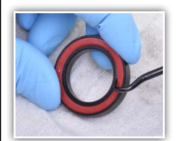
1. Lift up seal using a utility knife or pick. If servicing bearings outside of BB cups, remove both seals. Clean seals and set aside. For Angular Contact bearings, note which side takes the black seal.