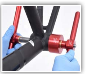
5. Spin on second handle and tighten handles together until you feel the bearing pop out of the cup.