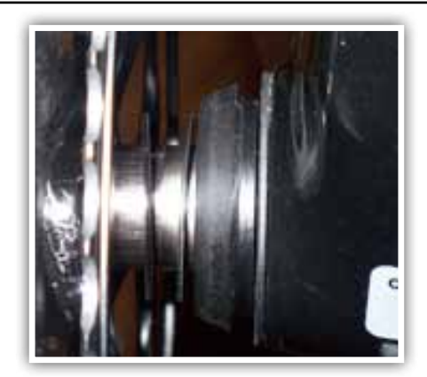
Install crank spindle through the adapters and tighten per manufacturer's instructions.