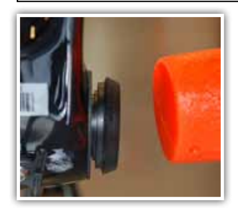
If not already installed, press PF30 bottom bracket cups into frame. Identify left and right side adapters. Start inserting adapters into bottom bracket bearings by hand. Seat adapters using a rubber mallet.