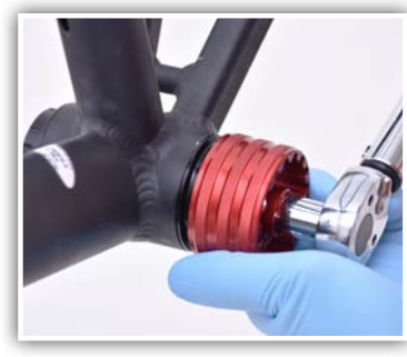
Continue to turn cup clockwise until flush against the outer face of frame. Finish tightenting cups using Wheels Mfg BB Socket [<u>BBT00L-48-44</u>] or Flat Wrench [<u>WRENCH-BB48-44</u>]. Tighten cups 35Nm - 50Nm.