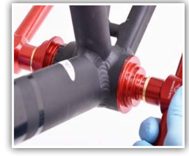
7. Spin on second press handle and fully tighten until drive side cup is flush with frame.