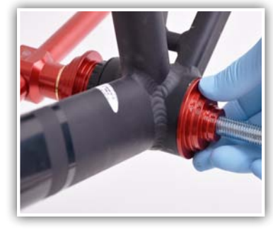
6. Slide second BB adapter onto threaded rod and into the opposite side of the bottom bracket shell. Match the correct step size with the BB shell inside diameter. Adapter should fit with little to no play.