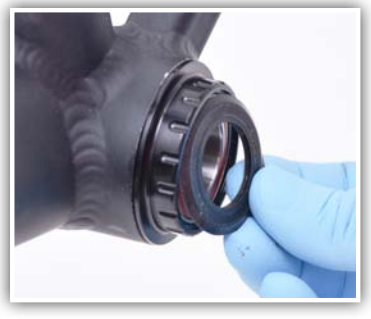
12. Outer silicone dust seals are placed directly against bearings. For added sealing, apply grease between seal and bearing.