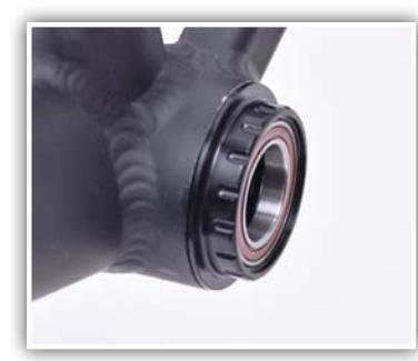
11. Bottom bracket is now installed. Install crankset per crank manufacturer's instructions.