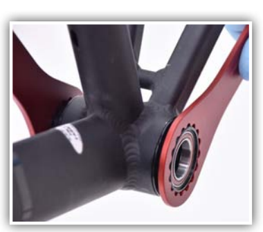
10. Frames with loose fitting cups may need a tool on each cup to fully tighten.