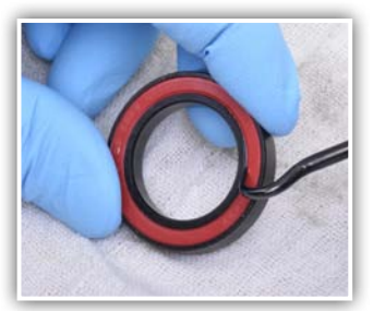
1. Lift up seal using a utility knife or pick. If servicing bearings outside of BB cups, remove both seals. Clean seals and set aside. For Angular Contact bearings, note which side takes the black seal.