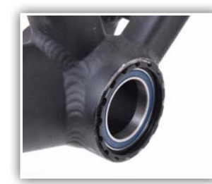
12. Remove press handles and adapters from cups. Bearing is now isntalled.