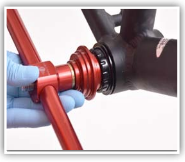
5. Using Wheels Mfg Universal Bottom Bracket Press [<u>PRESS-7</u> or <u>PRESS-7-PRO</u>], insert one BB adapter into drive side bearing. Match the correct size step on the drift with bearing inner diameter. Slide press handle + rod thru BB adapter and cup.