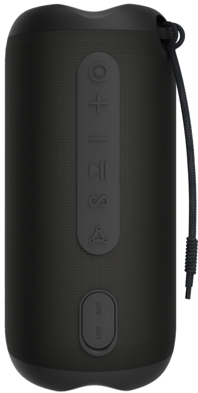
SHARK S1 WIRELESS PORTABLE SPEAKER USER MANUAL