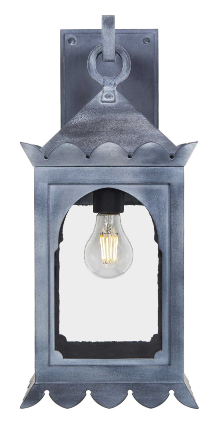
SHOWN IN SBLC ZINC FINISH WITH SBLC ANTIQUE GLASS