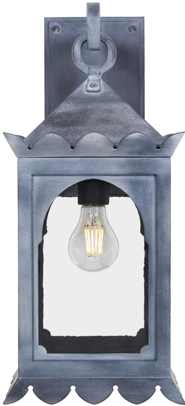
SHOWN IN SBLC ZINC FINISH WITH SBLC ANTIQUE GLASS