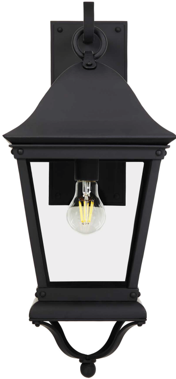
SHOWN IN SBLC GREY FINISH WITH SBLC CLEAR GLASS