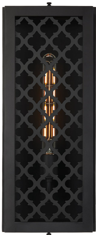
SHOWN IN SBLC GREY FINISH WITH SBLC ANTIQUE GLASS