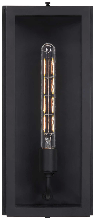
SHOWN IN SBLC GREY FINISH WITH SBLC ANTIQUE GLASS