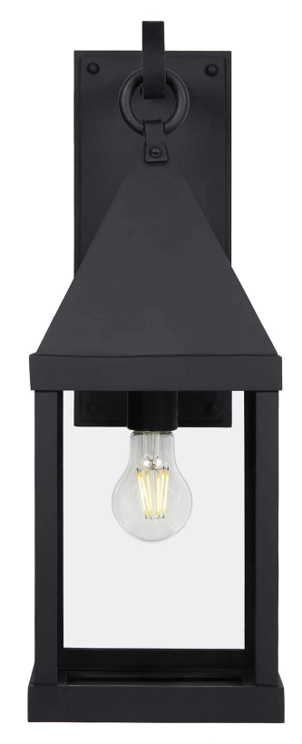
SHOWN IN SBLC GREY FINISH WITH CLEAR GLASS