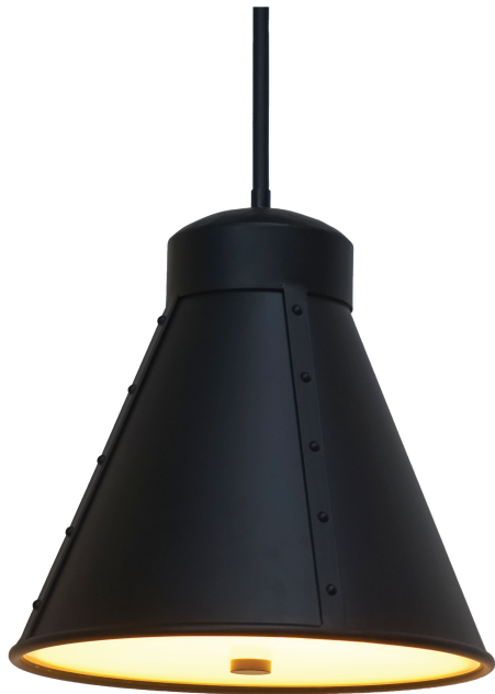
SHOWN IN SBLC BLACK FINISH WITH SBLC ETCHED GLASS