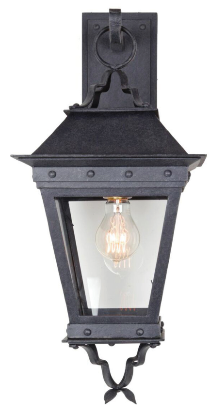
SHOWN IN SBLC GREY FINISH WITH SBLC CLEAR GLASS