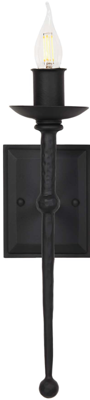
SHOWN IN SBLC BROWN WAXED FINISH