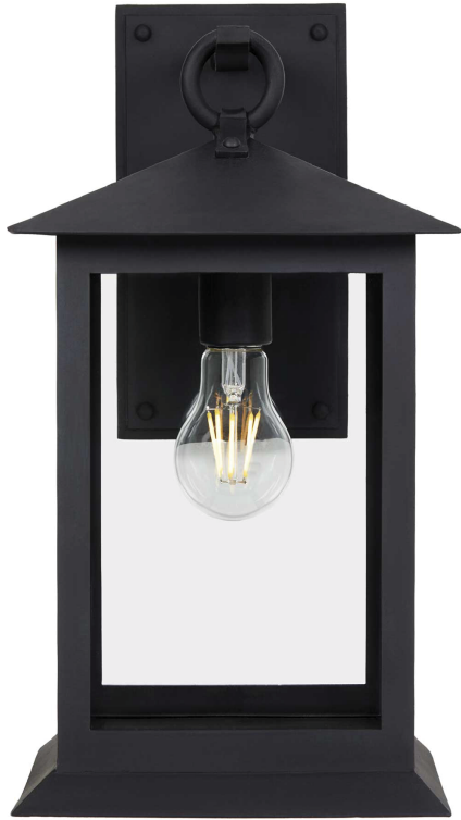
SHOWN IN SBLC GREY FINISH WITH CLEAR GLASS