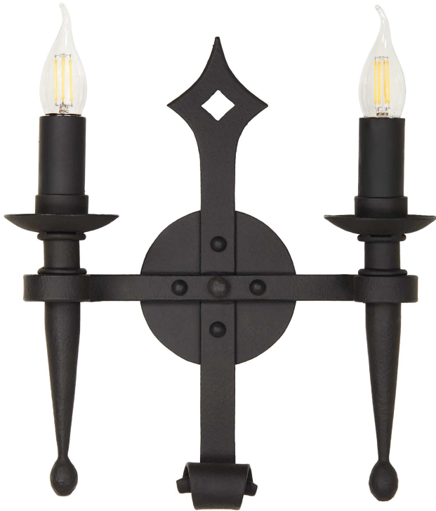
SHOWN IN SBLC OLD WORLD FINISH