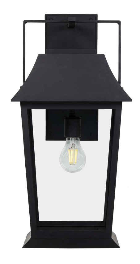
SHOWN IN SBLC GREY FINISH WITH CLEAR GLASS