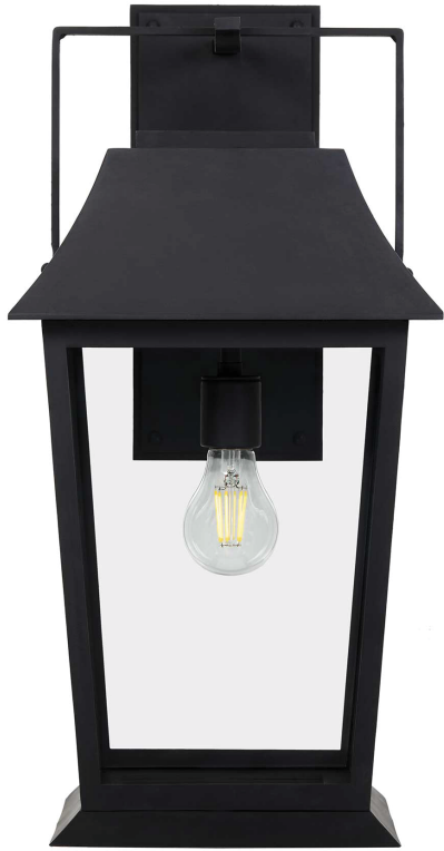
SHOWN IN SBLC GREY FINISH WITH CLEAR GLASS