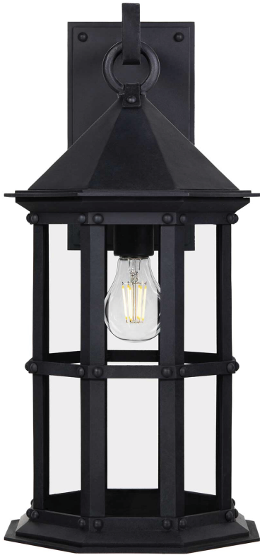
SHOWN IN SBLC GREY FINISH WITH SBLC CLEAR GLASS