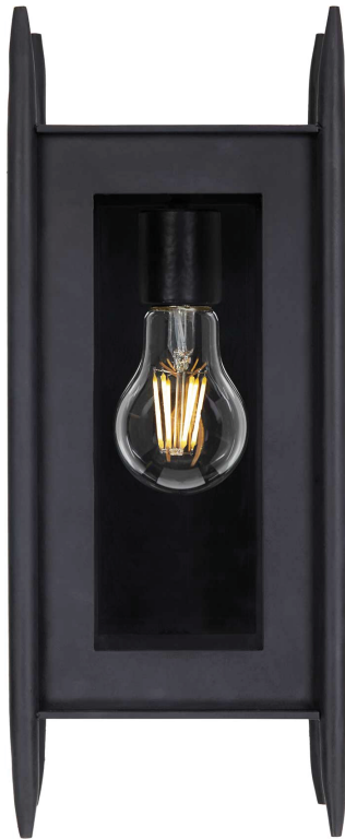
SHOWN IN SBLC GREY FINISH WITH CLEAR GLASS