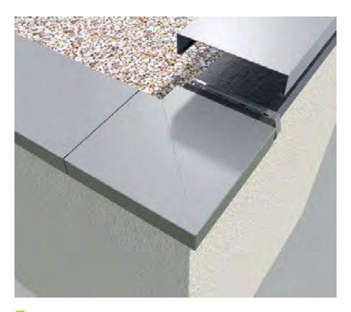
7. Starting at a corner working to your next junction, the last section of coping can be cut down on site to accommodate any variant dimensions between corner, pier and stop ends. Use touch up paint on cut edges. Contractor to use correct metal work tools, such as a circular saw.

6. Ensure 31mm dimension is maintained from external wall surface finish to external face of coping. On deeper edged coping that exceeds the normal 75mm leg, it may be necessary to use a small self tapper on the coping return to secure it fully.