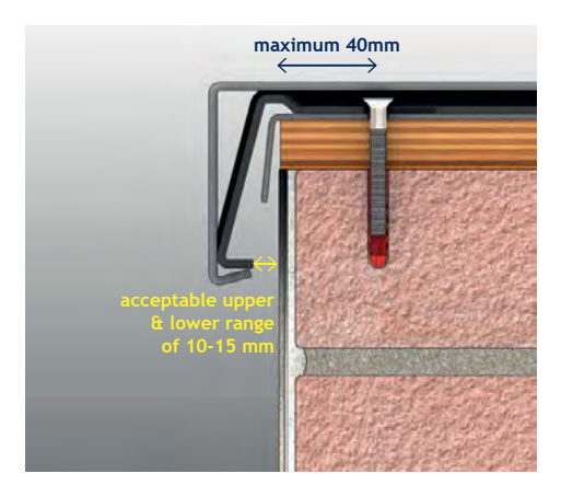
3. Secure brackets with minimum size No.12 x 50mm sized screws using the outer slots in the fixing straps at 1.5m maximum centres or as recommended based on wind uplift calculations or coping size. Additional screw fixings will be required on wider fixing straps. Maximum 40mm from fixing screw centre to external wall finishing surface.