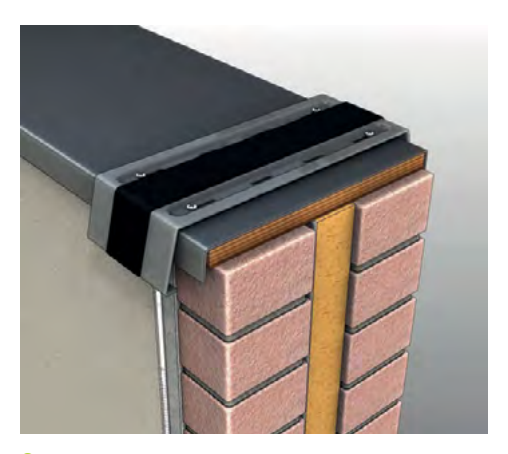
2. Position bracket with EPDM seal centrally over the wall. Maintain a minimum 10mm gap from the bracket inside return edge to the external wall surface finish. Illustration shows a render finish option which may be applied after installation of coping.