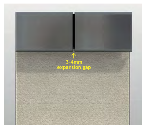
8. Maintain 3-4mm expansion gap at all joints.