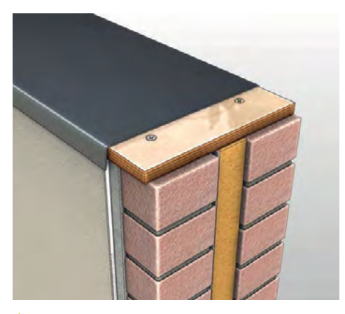
1. Ensure minimum 18mm marine ply and weatherproof membrane is fitted to the structure before commencing with the installation (all supplied by others).

Skyline wall copings are pressed formed rectangular profiles with acute angled front and rear folded edges which clip over fixing straps and are secured to the top of a wall section. Coping lengths are butt jointed over the fixing straps and compresses an EPDM seal for weathered protection and decorative finish.