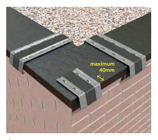
4. Always secure additional half brackets for corners and piers with the first fixing point with a maximum of 40mm from the external wall finish.