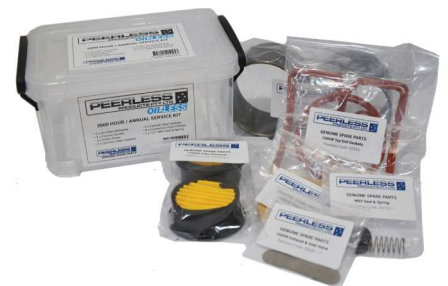
(1500W OIL-LESS ANNUAL SERVICE / 2000 HOUR SERVICE KIT)

Recommended once a year or every 2000 working hours this easy to install kit contains all your major consumable items to service both cylinders on one pump / motor assembly (will need two kits for P025).