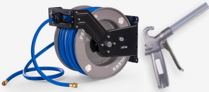
Hose Reels & Blow Guns Available