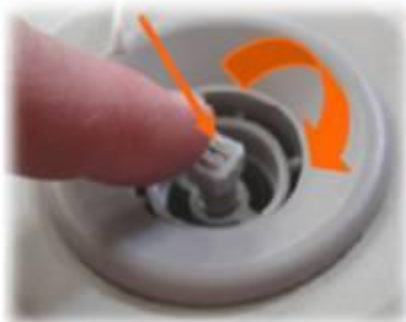
Pic 1 to open valve

Please take care when using any air product that the area is free from any object that may puncture or damage your product.