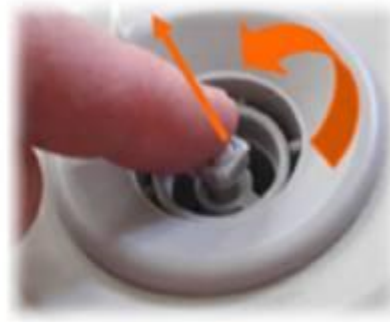
Pic 3 to close valve