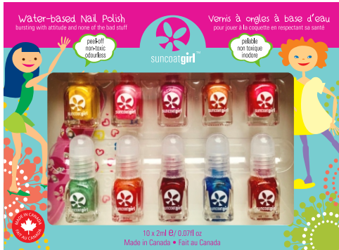
Party Palette #00972