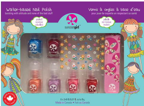
Mini Mani #00974