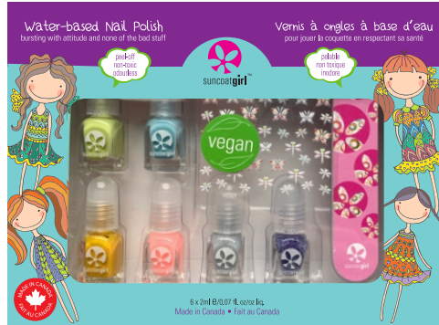
Smart Vegan #00971

Each box contains: 6 X 2ml nail polish colours, 1 page of nail decals and 1 double sided gentle-touch nail file.