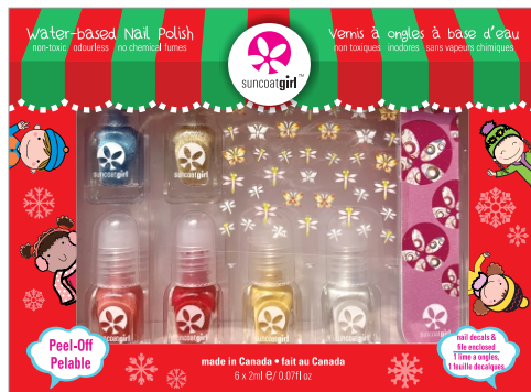
Magic Mini Mani #00985

Contents: 6 x 2ml nail polishes, 1 page of nail decals and 1 double sided gentle-touch nail file.