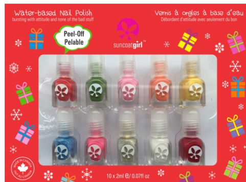
Merry Mini Mani #00977

Contents: 10 x 2ml nail colours, 1 page of nail decals and 1 double sided gentle-touch nail file.