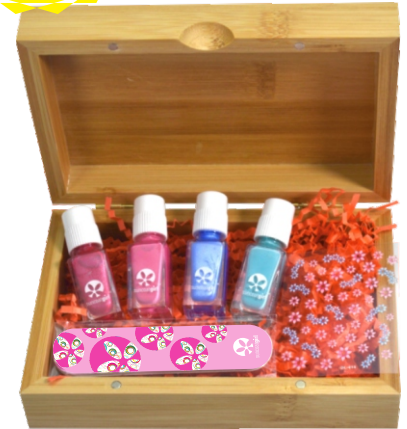
Go Glow Bamboo Manicure Box