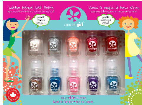
Flare & Fancy #00973

Each box contains: 10 X 2ml nail polish colours, 1 page of nail decals and 1 double sided gentle-touch nail file.