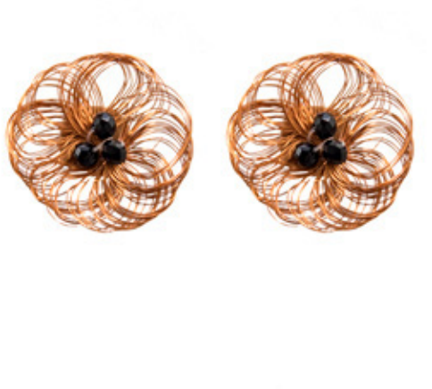
Little Flowers Copper Earrings Copper threads & black crystals CODE 0025 Price 6