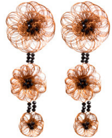
Tripple Roses Copper Earrings Copper threads & black crystals CODE 0027 Price 22