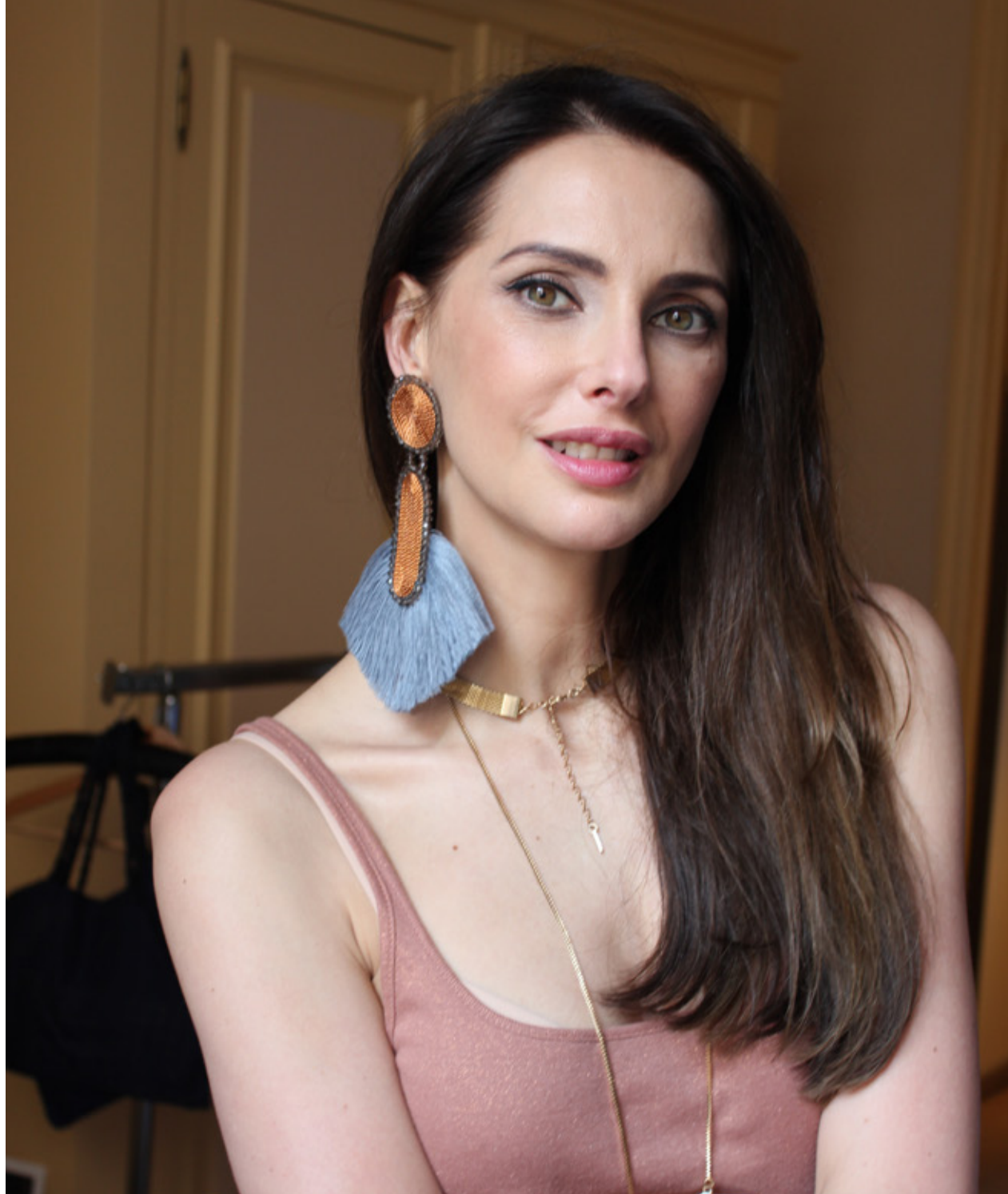
F r e d e r i q u e B e l A c t r e s s