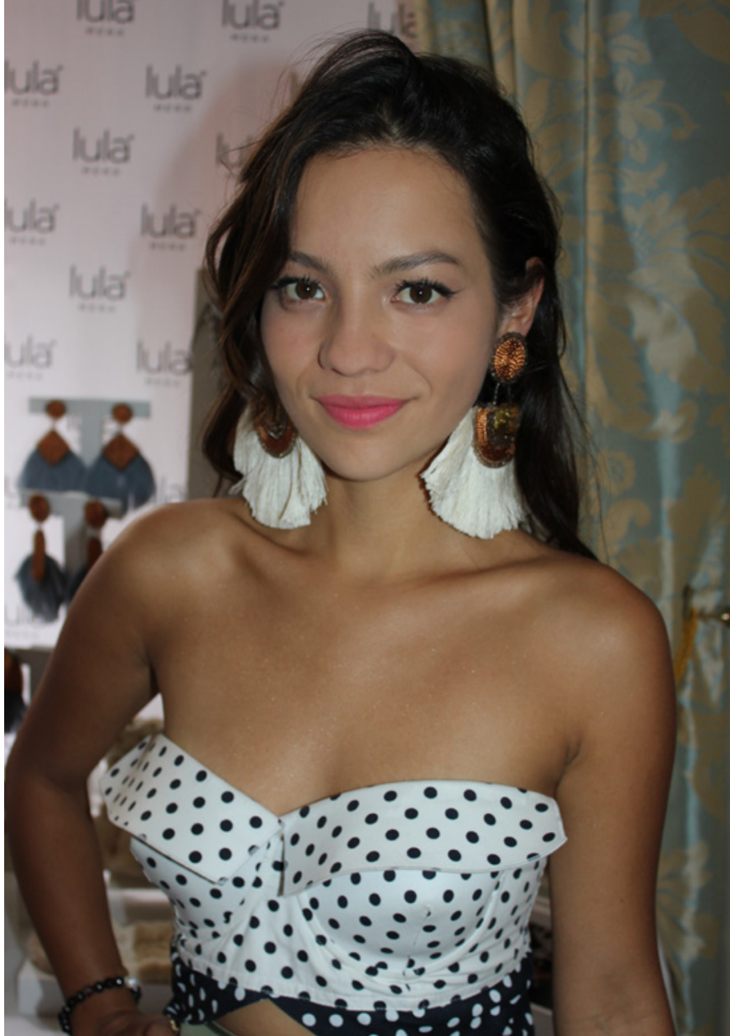
N a t a l i a R e y e s A c t r e s s