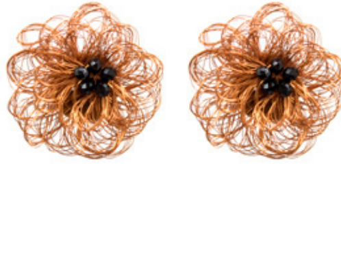
Little Rose Copper Earrings Copper threads & black crystals CODE 0026 Price 12