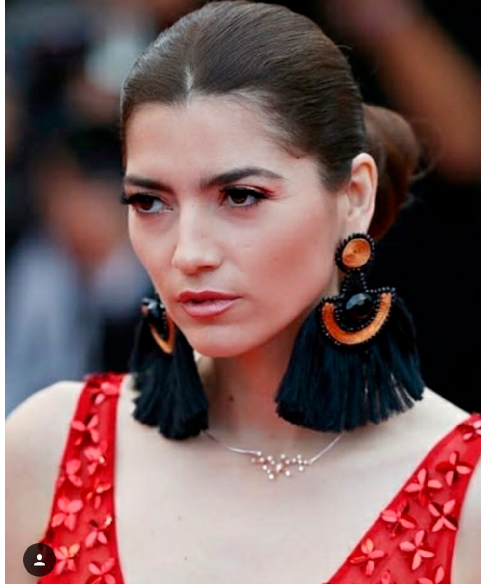
B l a n c a B l a n c o A c t r e s s