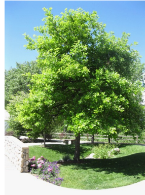
Swamp White Oak

Silver or Soft Maple Red Maple Serviceberry River Birch Hackberry Autumn Purple Ash Poplar Swamp White Oak Willow Arborvitae American Linden