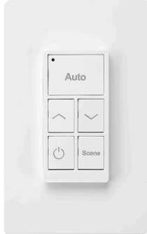
SMRT-5B-WIRELESS-WH-BT WIRELESS 3 SCENE BLUETOOTH WALL SWITCH