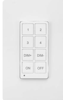
SMRT-8B-WIRELESS-WH-BT WIRELESS 4 SCENE BLUETOOTH WALL SWITCH