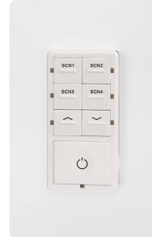
SMRT-7B-WIRED-WH-BT 120V/277V 4 SCENE BLUETOOTH WALL SWITCH