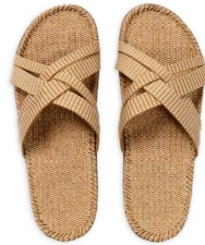
Creamy white No 026