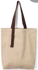
Brown coffee No 901_156