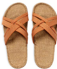
Orange stripes No 017