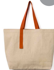
Spicy pumpkin No 902_155