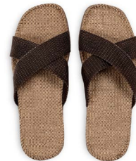
Brown coffee No 105