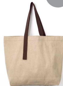
Brown coffee No 902_156