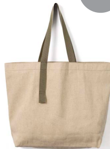
Dusty olive No 902_153