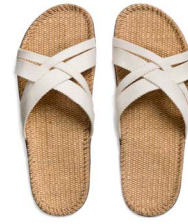
Smooth silk No 033