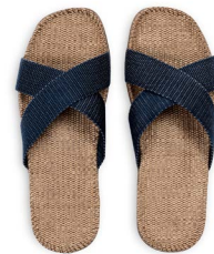
Midnight blue No 104