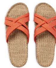
Sunset orange No 020