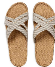
White stripes No 016