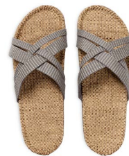
Grey stripes No 015