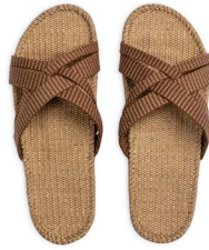
Cocoa tones No 030