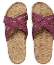
Dusty purple No 022