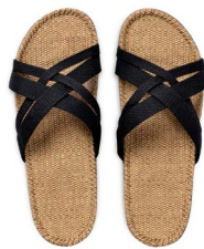
Black No 013