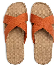
Spicy pumpkin No 106