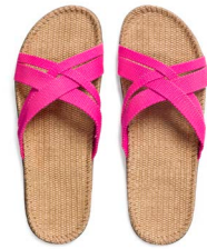
Pink posh No 032