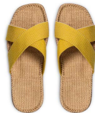
Mellow maize No 157