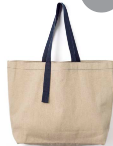
Midnight blue No 902_154