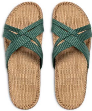
Misty moss No 031