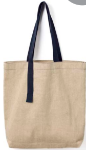
Midnight blue No 901_154