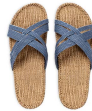
Blue dots No 023