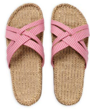
Pale pink No 021