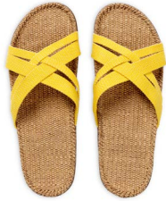
Sunlight yellow No 024