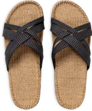
Charcoal No 029