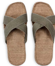
Dusty olive No 103