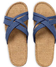
Blue stripes No 018