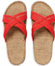
Raspberry red No 025