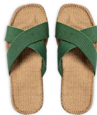
Groovy grass No 158