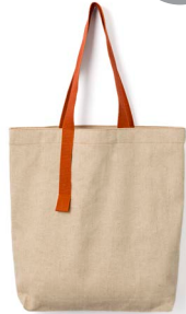
Spicy pumpkin No 901_155