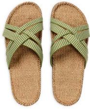
Green Leaves No 027