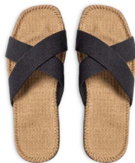
Rocky raven No 159