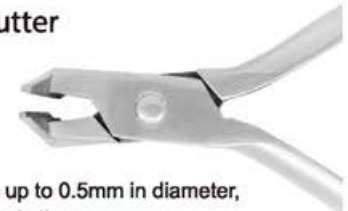
Distal End Cutter

Cutting archwires up to 0.5mm in diameter, inserting hard metal alloy