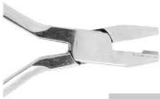
Crimple Hook Plier