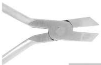
Three Jaw Plier