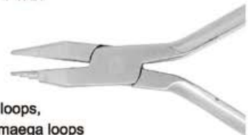
Tweed Loop Plier

For bending fine loops, stop loops and Omega loops