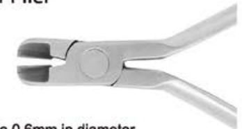
Heavy Cutter Plier