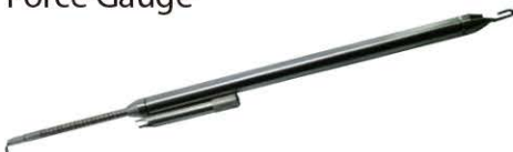
02-012-01 0-450g or 0-160OZ Laser mark