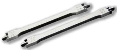
01-011-00 Shaft with replacement tip 4pcs/set