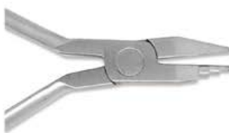
Omega Loop Bending Plier