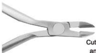
Ligature Cutter Plier

Cutting slot ligature wires up to 0.3mm and elastics, inserted hard metal alloy