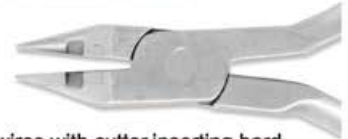
Light Wire Plier with Cutter

For bending fine wires with cutter, inserting hard metal alloy