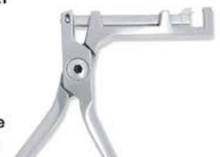
Cap Remover Plier

For removing removable cap of convertible tubes