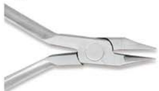
Light Wire Plier

For bending fine wires, inserting hard metal alloy