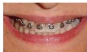
Metallic Conventional Bracket