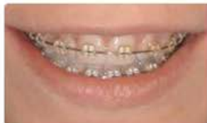
Aesthetic Comparison Bracket