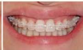
The same patient with CRYATAL 3D