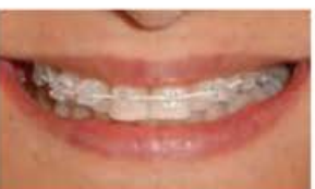
The same patient with CRYATAL 3D