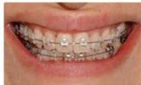
Aesthetic Self Ligating Bracket