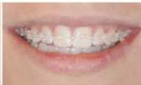
The same patient with CRYATAL 3D