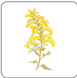
Goldenrod State Flower