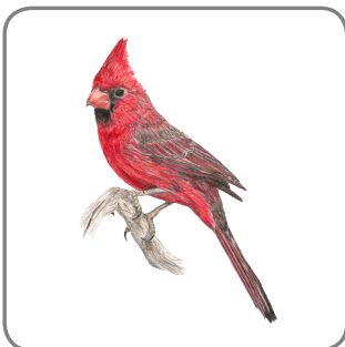
Cardinal State Bird