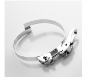
Clip-Grip Quick-Fix Clamp

All data refers to a medium and ambient temperature of +20 °C. * Available on request Subject to technical changes and colour deviations.