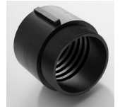
Combiflex PU Threaded Socket