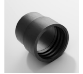
PU Cuff, electroconductive