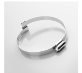
Clip-Grip Hose Clamp, screwable