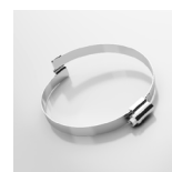
Clip-Grip Hose Clamp, screwable