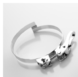
Clip-Grip quick action clamp