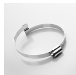
Clip-Grip Hose clamp, screwable