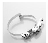
Clip-Grip quick action clamp