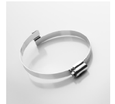
Clip-Grip Hose clamp, screwable