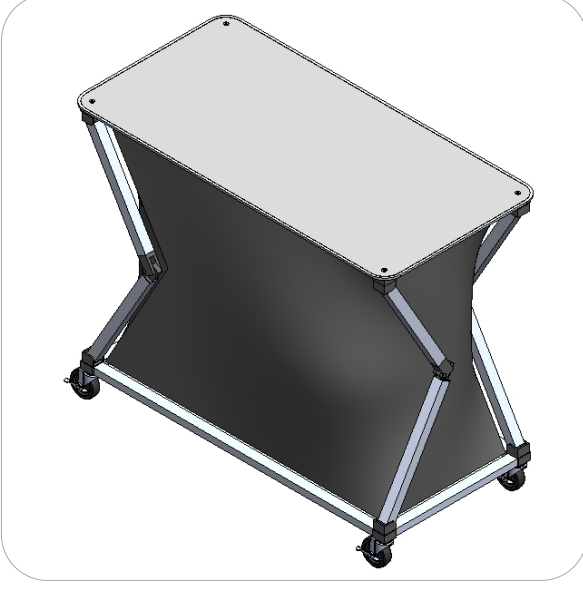
Step 2. Unzip and insert shelves.