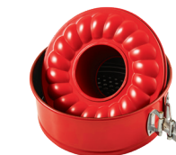
Springform Bundt Pan Part #: 34823