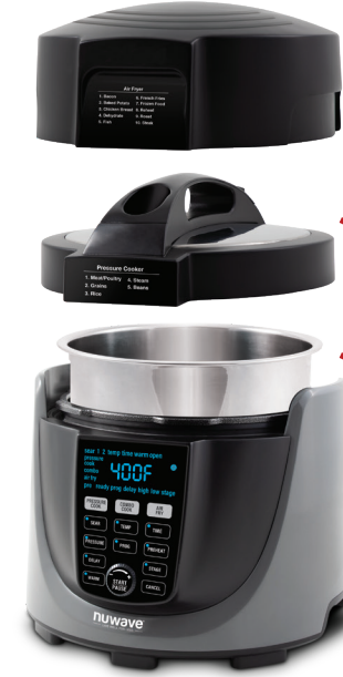
Air Fryer Lid Part #: 34805