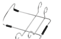
Lid Holder Part #: 34815