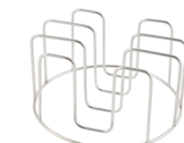
Rib Rack Part #: 34835