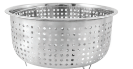
Stainless Steel Air Fry Basket Part #: 34818