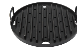
Grill/Griddle Plate Part #: 34833