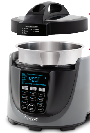
Pressure Cooker Lid Part #: 34839